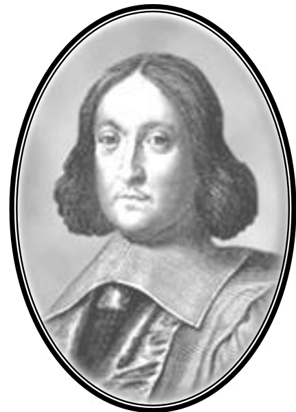
Pierre de' Fermat

Probability theory, like many other branches of mathematics, evolved out of practical considerations. It had its origin in the 16 th century when an Italian physician and Mathematician Jerome Cardan (1501-1576) wrote the first book on the subject "Book on Games of Chance (Liber de Ludo Aleae)" It was published in 1663 after his death.